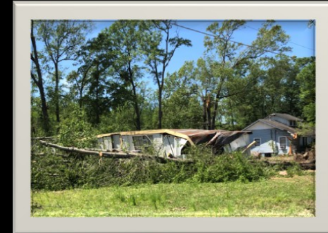
like this from straight-line winds and they were able to remove the trees from the roof and the parish helped remove debris. They appreciated being checked on by UMC Disaster Response.