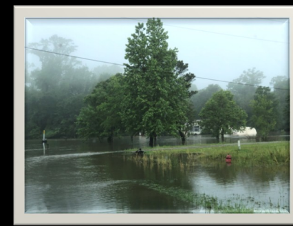
Storm Response—May 9 & 10, 2019 Blanchard, Louisiana